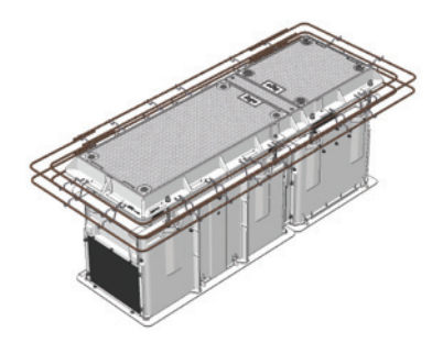
CLASS D CHAMBER AND COVER SET PACKAGE 2100 X 600 X 700H